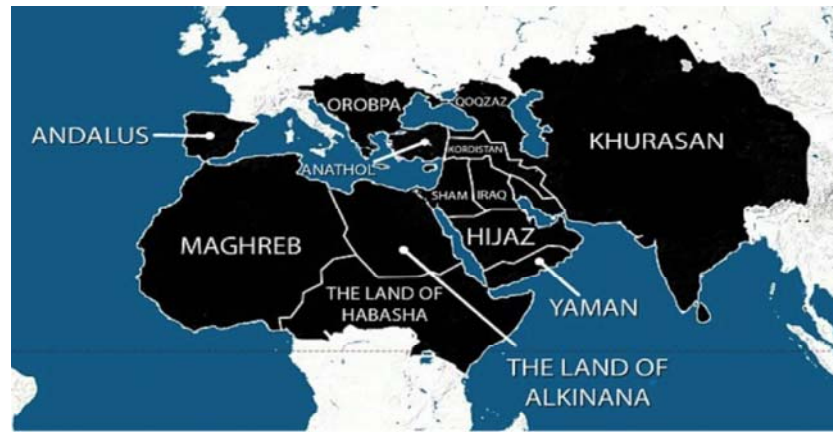
Pic: ISIS five year plan map.